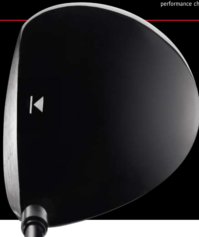
LARGE HITTING AREA

A classic pear profile, deep face, 440cc, high performance titanium driver that produces mid launch with low spin.