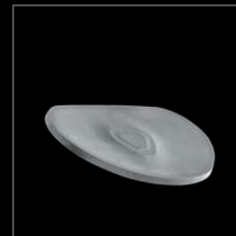
INTERNALLY MILLED FACE INSERT